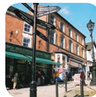
Ashbourne town centre