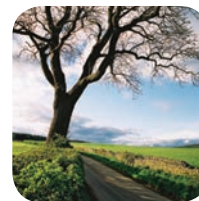
Scenic views around Ashbourne