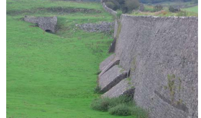
Limekiln (top left corner of photo)

The quarry opened soon after the railway - as soon as stone could be taken for sale. Victorian quarry workers drilled out the limestone, and used narrow gauge trolleys to take it to the main rail line. The dolomite-rich limestone made good building stone. Most quarry workers farmed locally too.