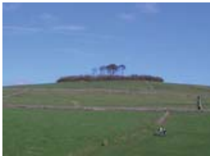
Minninglow Neolithic tomb seen from the High Peak Trail

Keep going along the surfaced trail. Notice the built up embankments in the valley ahead.